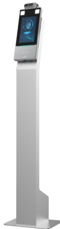
Floor-stand mount (need additional EP-S31-W-NB bracket)